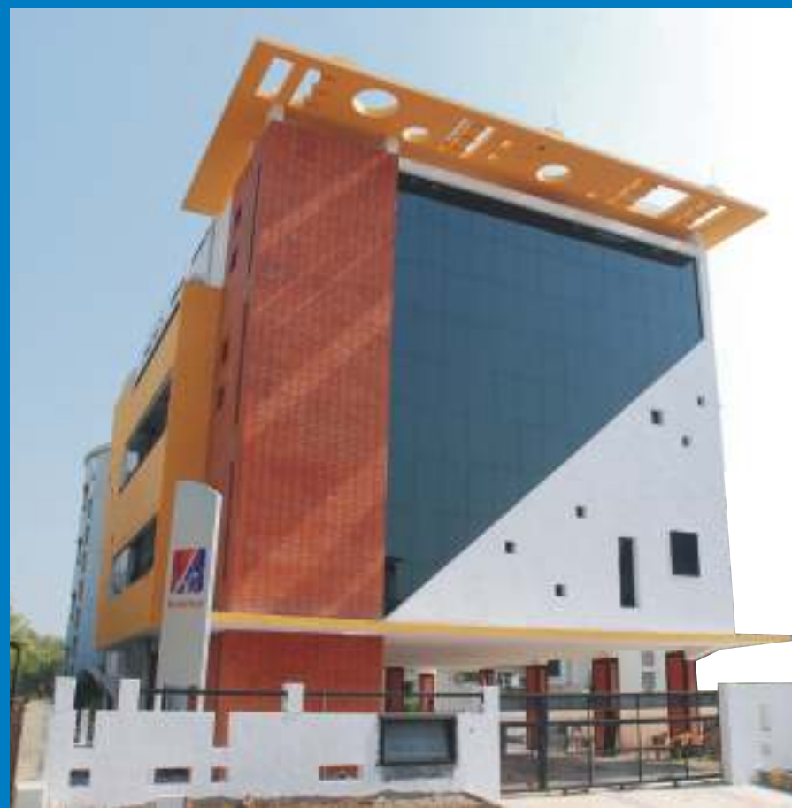
Our Head Office at Nagpur