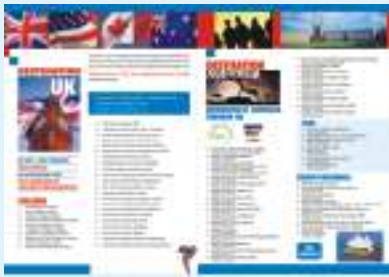
Brochures & Leaflets